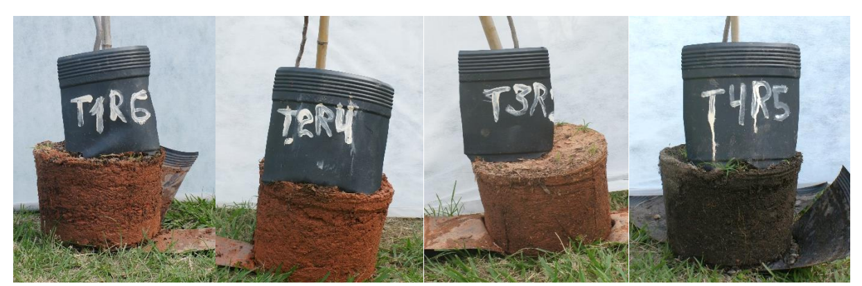
Figure 3 : Aggregation for different substrate compositions used in the production of three urban afforestation species, by the time of 12 months after transplantation.

Treatments are: cattle manure, subsoil and sand 50^*:40:10 and three substrates with different proportions of biosolid, subsoil and sand 25:65:10; 50:40:10 and 100. Mean values followed by the same letter, in columns, do not statistically differ by the Tukey test (P \ge 0,95). For substrate aggregation no significant difference was detected by the F-Test.